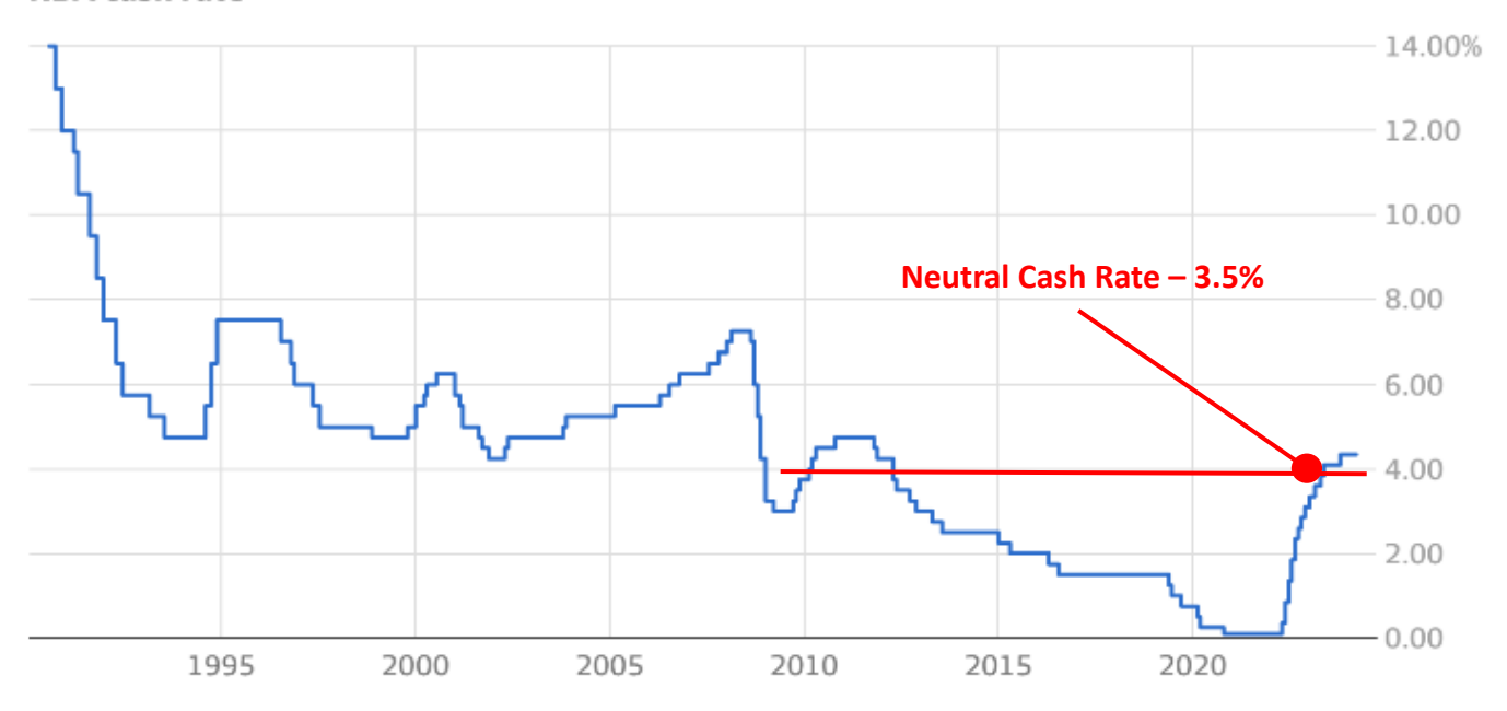
Chart: Michael Read . Source: RBA

Furthermore, inflation has not proven to have found its natural bottom limit as of yet, and it could be bouncing on the wrong side of 3% for longer than anticipated. Again, this would increase the risk of a harder landing than the current market consensus.